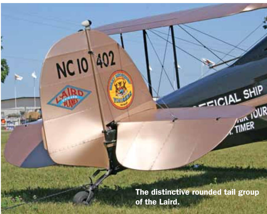
The distinctive rounded tail group of the Laird.