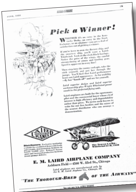
Aero Digest June 1929