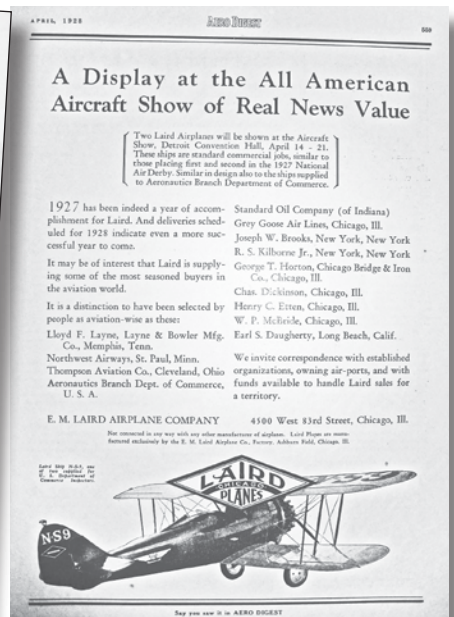
Aero Digest April 1928