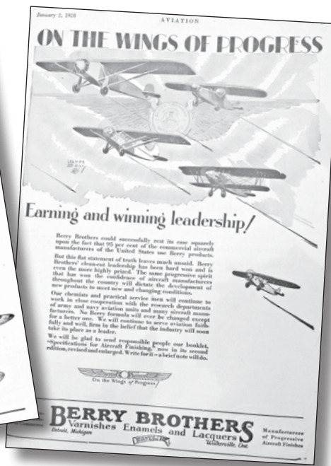
Aviation January 1928