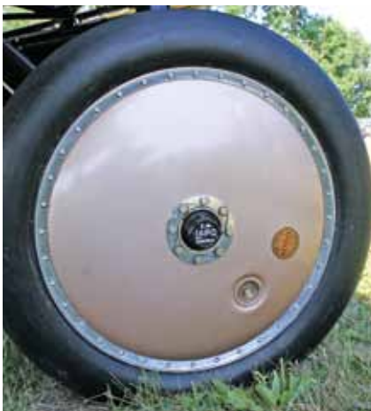
These 30 x 5 wheels were made by Dick Fisher of California.