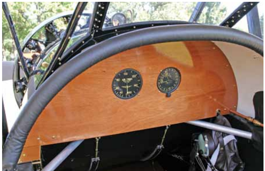
A spacious front cockpit seats two—note the fuel tank below the panel.