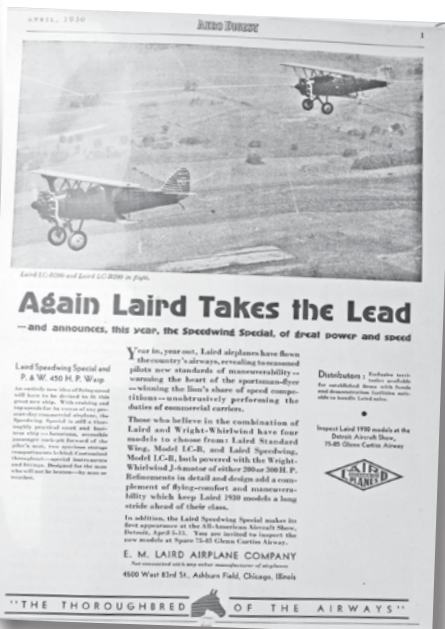
Aero Digest April 1930