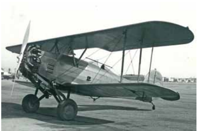
The Laird as a skywriter with a 30-gallon smoke-oil tank in the front cockpit and extended stacks.