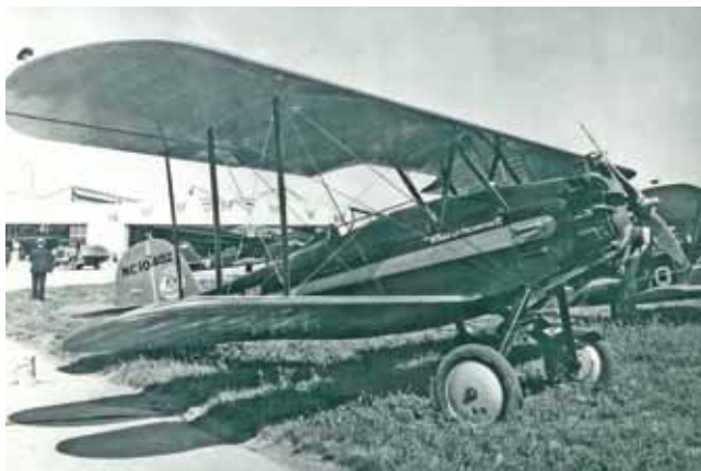
During the Ford National Air Tour in 1931.