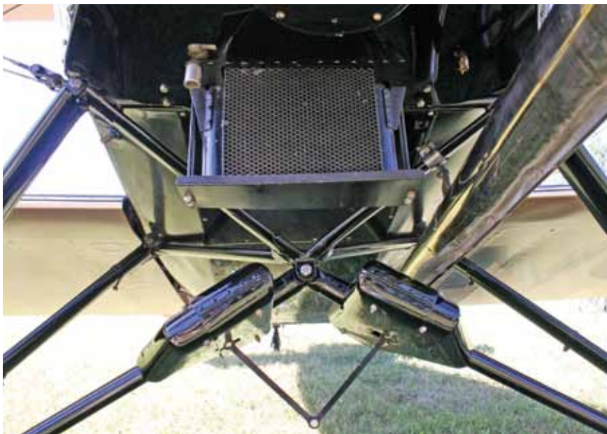
Rubber shock cords cushion the Laird's landings.