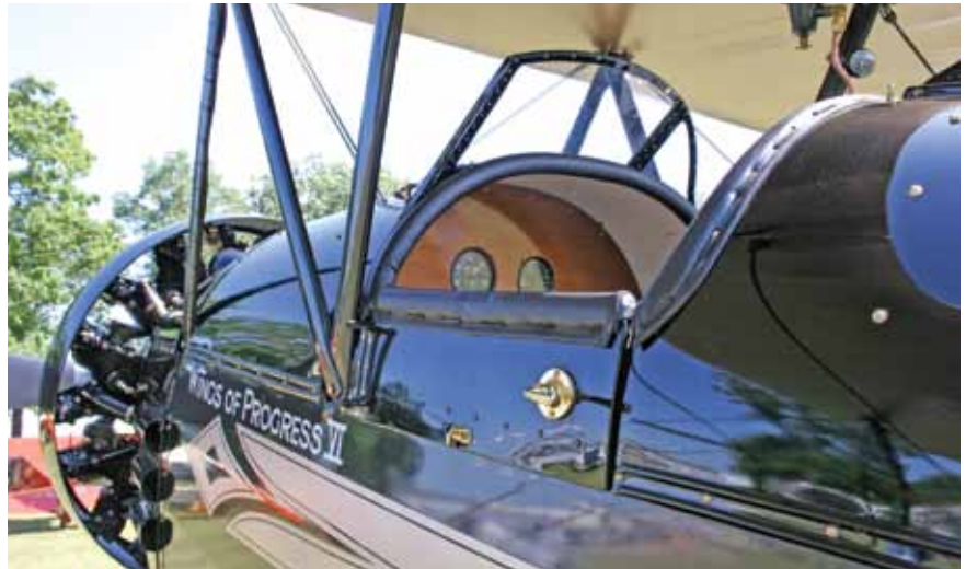
The folding windscreen for the front cockpit can easily be installed or removed.